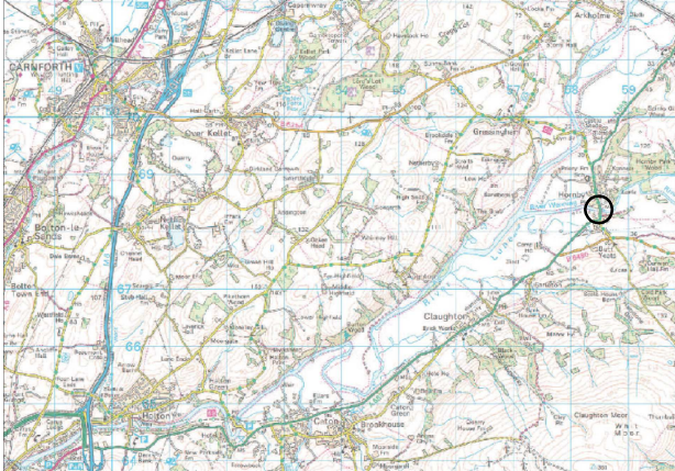
Location Plan (not to scale)

This map is reproduced from Ordnance Survey material with the permission of Ordnance Survey on behalf of the Controller of Her Majesty's Stationery Office © Crown Copyright. Unauthorised reproduction infringes Crown Copyright and may lead to prosecution or civil proceedings. OS Licence 100023320.